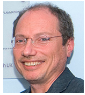
Insight from Frederic Geissmann

The developmental relationship between monocytes, dendritic cells (DCs), and macrophages has been well defined in mice, but human DC development is less well understood and has been hampered by the lack of a suitable culture system. Now, two papers published in this issue describe a novel in vitro culture system for human DC progenitors and the use of this system to elucidate the pathway of human DC development.